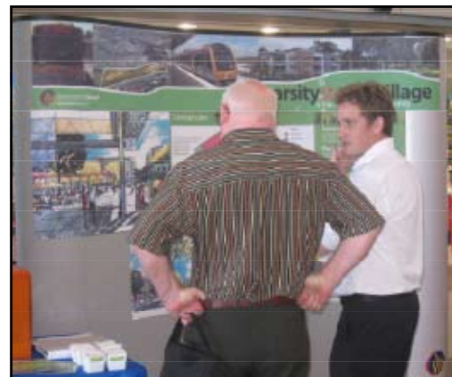
Queensland Transport's project team at Robina's Easy-T Shopping Centre on 22 November 2007; the team was also at Varsity Lakes' Market Central on 1 December.

If you'd like to know more about what's happening with the rail project, please contact the Robina to Varsity Lakes Rail Extension project team on 1800 662 240 (freecall) or visit www.qr.com.au/seqip .